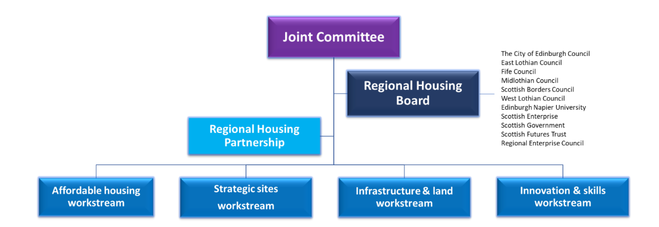
Figure 1 – Regional Housing Governance and Workstreams

3.6 The four key workstreams approved by the Regional Housing Board take a holistic approach to housing delivery and seeks to enable the accelerated delivery of housing and increase the supply of affordable homes across the region. The regional housing governance and workstreams are outlined in Figure 1 below.